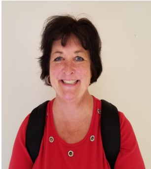
Mary Clair State Office